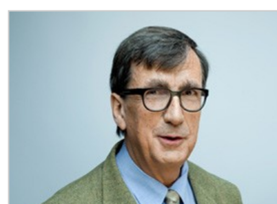
Bruno Latour, Scientific Director and Vice-President for Research of "Science Po" Paris.

Bruno Latour , born in Beaune, Burgundy, was trained first as a philosopher and then an anthropologist. He has been professor at the "Centre de sociologie de l'Innovation" at the "Ecole Nationale Supérieure des Mines" in Paris, and visiting professor at the university of California (UCSD), at the London School of Economics and at the Harvard University.